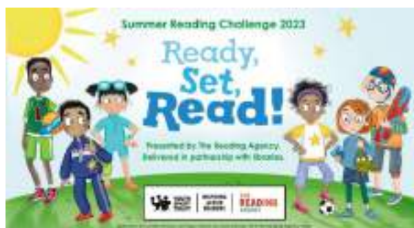
2 - SRC 2023 schools information

Summer is here which means the Summer Reading Challenge is back!