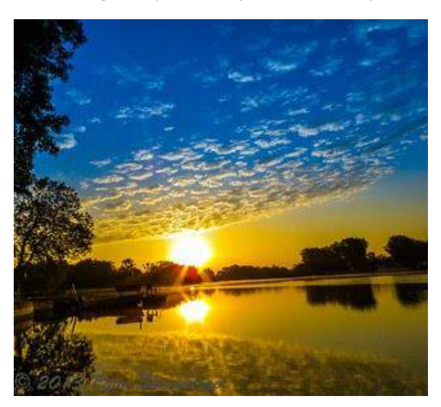
7 - And Finally....fingers crossed that the weather continues to be good and you have a great weekend and can join us for the sporting events we have planned for next week.