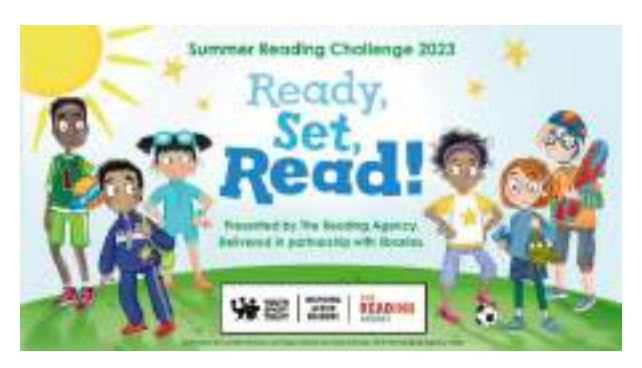
3 - SRC 2023 schools information

If your child enjoys reading then please get involved in the Stockton Library Summer Reading Challenge - details below