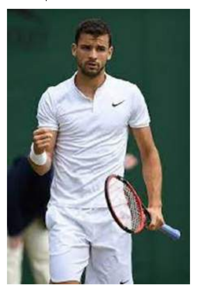
4 - In 2018, tennis player Grigor Dimitrov hit national headlines. Watch: <a href="https://www.youtube.com/watch?v=Sd0EEHTJFqc">https://www.youtube.com/watch?v=Sd0EEHTJFqc</a>. I wonder why you think Grigor was praised? I wonder if you can of any more examples of someone building someone up, rather than knocking them down?

We all have mountains to climb but please be humble and kind.