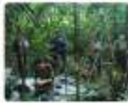
His knowledge about the world helped him to find the island.

The children were free in 100 days until they returned. The island was a great place to live. They had to eat the food that they had with them. They had to be careful of the animals that were there. They had to be careful of the people that were there.