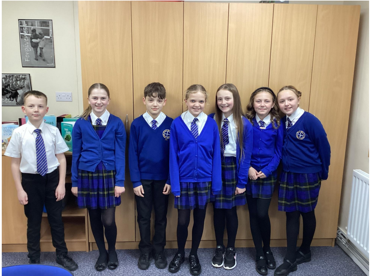
3 - Sports Leaders