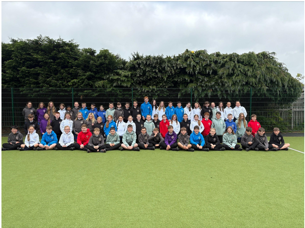
2 - So Proud of Year 6 this week they look great in their Leavers Hoodies!