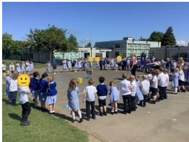
Choices at the Ice Cream Van for Y6!