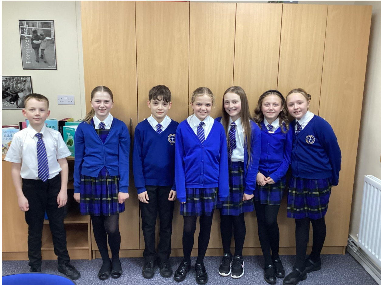
2 - Sports Leaders