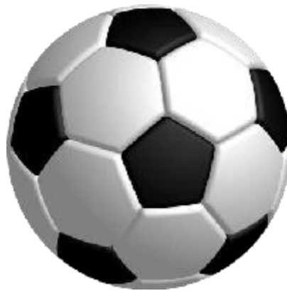
3 - Fantastic Y4 Football Stars - Lee Stephenson Cup at Rockcliffe!

The team did really well and managed to make it out for the group stages and into the semis. They were beaten 2-1 but came third in the whole competition due to goal difference.