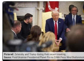
Pictured: Zelensky and Trump during their recent meeting.