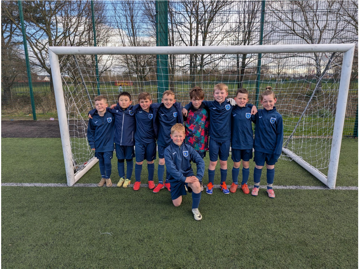
4 - Fantastic Football Champions! Well done to footballers in Y3/4 who won a competition at Northfield last week!