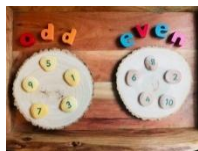
Ten Rainbow Maths Facts